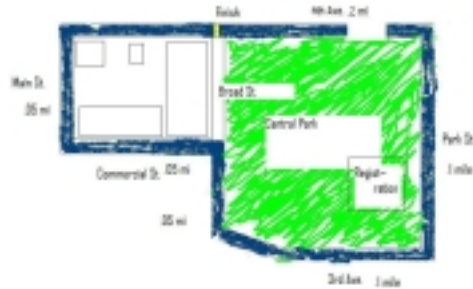
Proposed Grinnell Detention Course approx. 35 mi